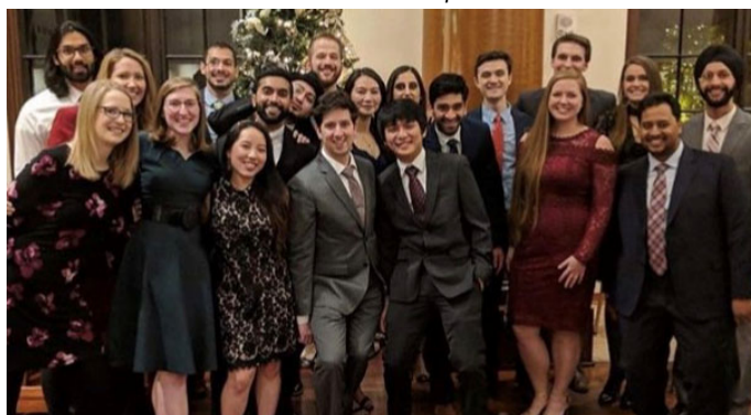
Class of 2020 (Picture taken at the 2019 Holiday Party)